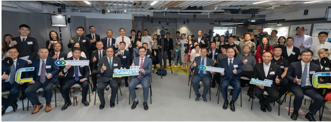
Representatives from Innovation, Technology and Industry Bureau, Cyberport, and the SZHKTECH, along with representatives from landing enterprises of the Guangdong-Hong Kong-Macao Youth Innovation and Entrepreneurship Hub (Hong Kong), attended the MoU signing and plaque unveiling ceremony between Cyberport and the SZHKTECH.